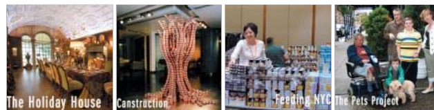
The Holiday House Construction Feeding NYC The Pets Project